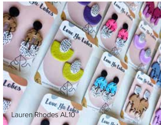
Lauren Rhodes AL10

Lauren Rhodes of Love Ya Lobes creates unique polymer clay earrings that combine vibrant colours and bold designs. Each pair is handcrafted with attention to detail, offering lightweight, stylish accessories that make a statement. Visit Lauren at AL10.