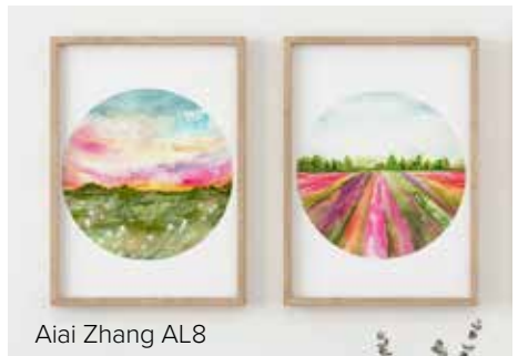
Aiai Zhang AL8

Jane Elliott of Modstitch AL3 has teamed up with Australian artists to create a collection of beginner-friendly cross-stitch kits, offering an enjoyable and accessible hobby for all. Each kit comes complete with everything needed to create beautiful, modern, and colourful designs, making it easy for anyone to dive in. These kits are the perfect addition to any gift collection.