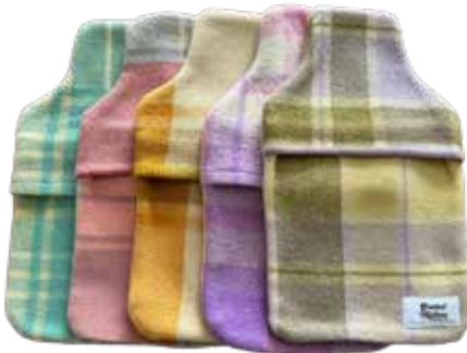
Louise Lowe AL9

Blanket Matters is the creative vision of Louise Lowe, who transforms Australian wool blankets into treasures. Through restoration, and repurposing, Louise ensures these blankets are revitalised and built to last for generations to come.